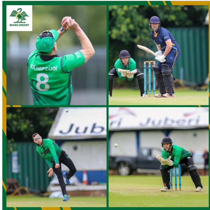
A few pics from the Devon match